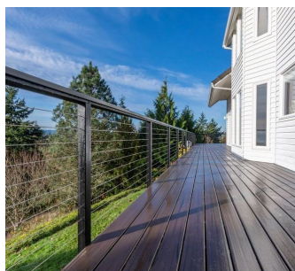
Aluminum Railings for Residential and Commercial Projects