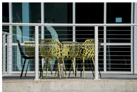
Stainless Steel Cable